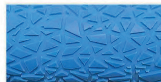
CUSTOMIZED D - WEB