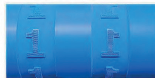
CUSTOMIZED F - NUMBERS