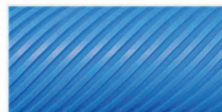
CUSTOMIZED E - VITE 1-1