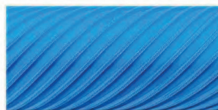
CUSTOMIZED A - VITE FINE