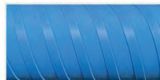
CUSTOMIZED C - VITE LARGA